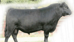
BUBS SOUTHERN CHARM