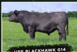
URF BLACKHAWK G14

ANGUS, SIMANGUS, & CHAR-ANGUS also selling a select group of elite registered Angus females and commercial heifers.