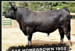
SAF HOMEGROWN 1902

AAA 19802674 SIRE: CONNEALY BLACKHAWK 6198 MGS: SAV RECHARGE 3436