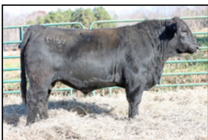
LOT 69 HSCC BOUNTY M69 SIMANGUS • WW +100 • YW +160