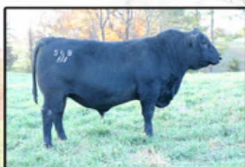
EBS 568 - Basin Jameson x SydGen Bonus

Registered Angus, SimAngus, Simmental, and Charolais Bulls Registered and Commercial Open Heifers, Bred Heifers, Bred Cows, & Pairs