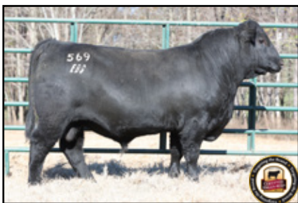
LOT 1 EBS JAMESON 569 WW +98 • YW +165 • $C +347