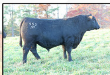
EBS 555 - Basin Jameson x SydGen CC&7