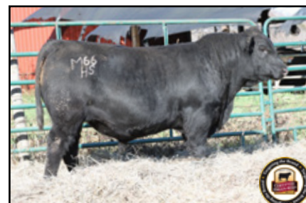
LOT 42 HSCC ICONIC M66 CED +8 • BW +1.1 • MARB +1.08