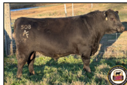
LOT 24 AF DOMINANCE 508 WW +92 • YW +164 • $C +354