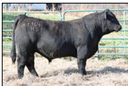
LOT 70 HSCC BOUNTY M69 SIMANGUS • WW +82 • YW +142