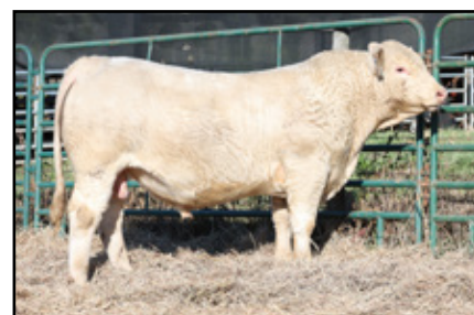
LOT 73 HSCC SILVERSMITH M79 CHAROLAIS • MARB +.28 • RE +.89