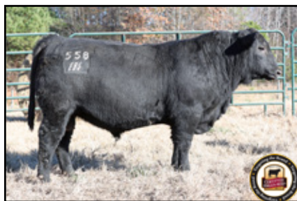
LOT 2 EBS JAMESON 558 WW +99 • MARB +1.22 • $C +332