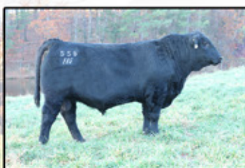
EBS 558 - Basin Jameson x SydGen Enhance