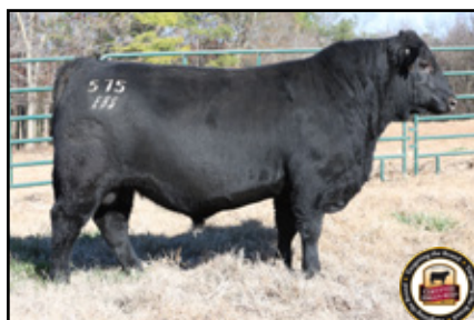
LOT 14 EBS JAMESON 575 CED +10 • WW +98 • YW +162