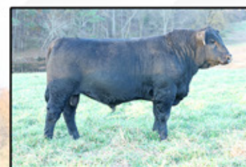
EBS 510 - EZAR Step Up x CoX Excaliber 8590