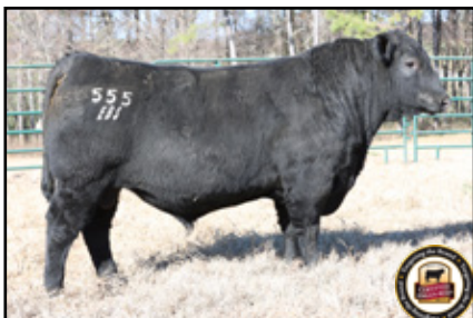
LOT 4 EBS LAST CALL 555 WW +86 • MARB +1.64 • $C +349