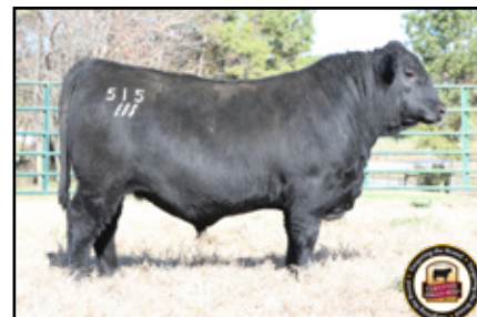
LOT 10 EBS FIREBALL 515 CED +8 • WW +93 • YW +164 MARB +1.76 • $B +251 • $C +380