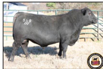
LOT 3 EBS JAMESON 568 WW +107 • $W +112 • $B +192