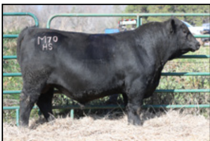
LOT 38 HSCC MAN IN BLACK M70 WW +91 • YW +154 • $C +297