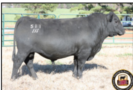
LOT 11 EBS B BANDOLIER 511 CED +12 • $B +201 • $C +334