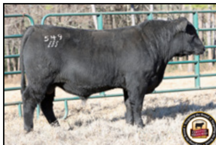
LOT 7 EBS STEP UP 549 RE +1.01 • $B +193 • $C +300