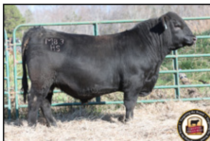
LOT 39 HSCC MAN IN BLACK M83 WW +99 • YW +168 • $C +301